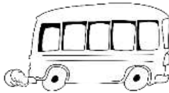
el autobús amarillo