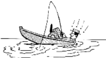
el lago azul

Find out which color crayon to use on each picture by reading the Spanish phrase below it. Then, have fun coloring!