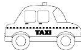
el taxi rojo